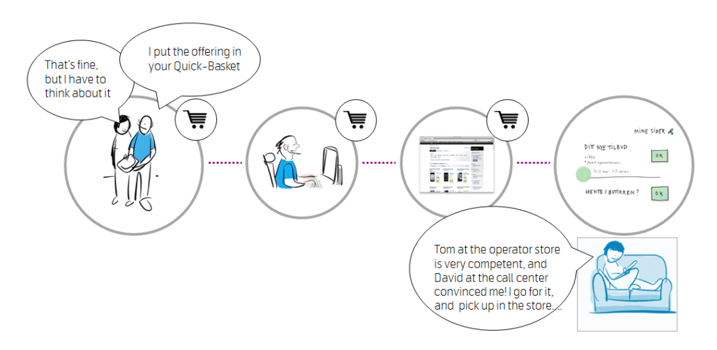
Figure 3: The target picture (the what-dimension) designed by the cross-functional team