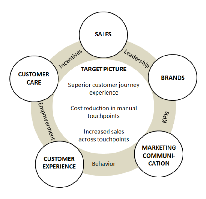
Figure 1: The complex triadic dilemma: Superior customer journey experience, increased sales and service in each touchpoint and cost reduction.

The design activity was thus aimed at exploring this complex dilemma, and to co-design service concepts that visualise solutions to the dilemma. The participants in the design activity were middle managers responsible for different corporate functions such as customer care, customer experience, sales, brands and marketing communication as illustrated in Figure 1. Within each function, operative managers also participated: For example, in the Sales functions, operative managers with responsibility of sales in web-shop, in operator store and in customer care participated.