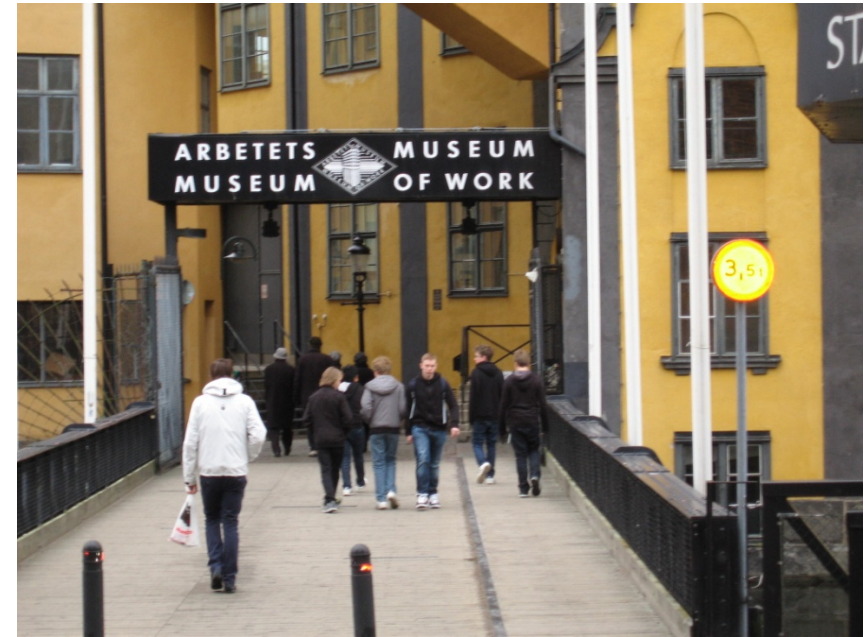
Norrköping's industrial landscape.

Jonas Berglund presented a dummy of Unfold , including its graphic design, and showed examples of the kinds of documentary photography and reportage it was to include, with a launch planned for late autumn. Esther Shalev-Gerz led a discussion and answered questions about Sound Machine in its two sites: in the Museum and through the city to the bridge and the sound installation there.