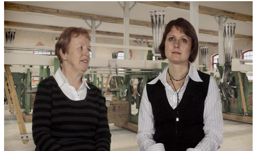
From Sound Machine by Esther Shalev-Gerz