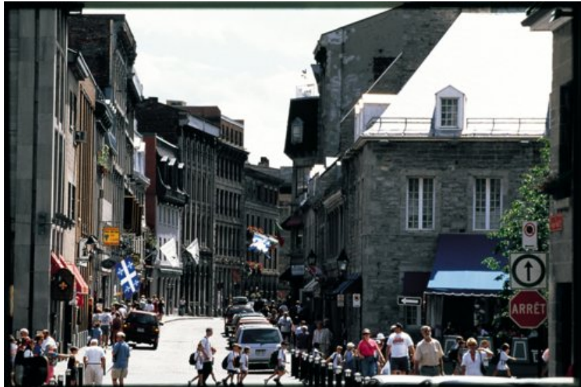
Figure 5. The photograph after modification. The Canadian flag has been replaced by the Quebec flag.

In effect, the image desired by the provincial government was of a Quebec that was “Canada-free” – that is, not reliant on the national interest. If Toronto’s brand strategy was to offer diversity through a politics of inclusion, Montreal’s brand of diversity was of a rather more exclusive sort. By presenting itself as unmoored from national tethers, the city could better highlight its distinctive ethnolinguistic offering.