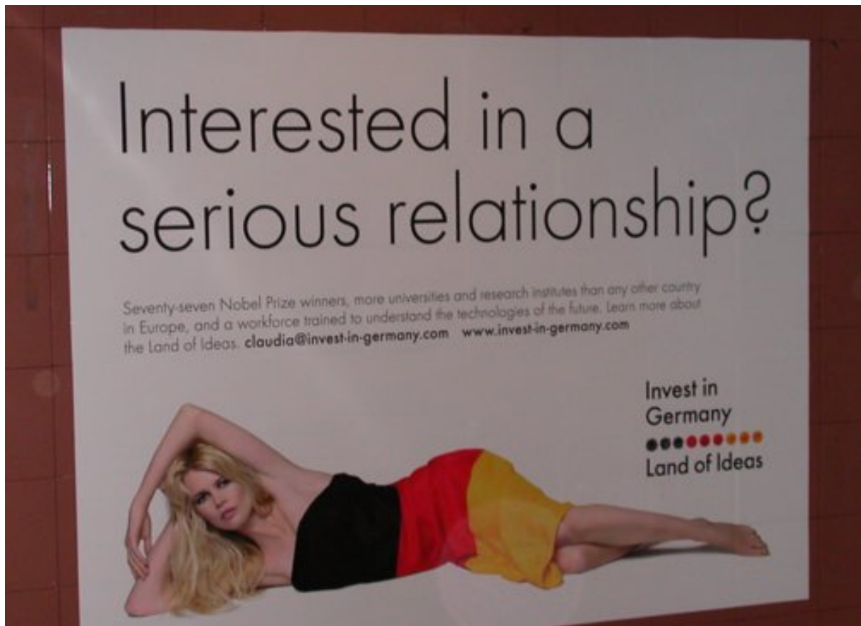
Figure 1. Germany’s 2006 branding campaign, on display at Grand Central Station, New York, NY.

This brief essay offers an overview of the phenomenon of place branding and the rationale that motivates its increasing popularity among government decision-makers and civic leaders as a key tool of urban, regional and national economic policy. It addresses the contradictions inherent in place branding through the category of “monopoly rent,” a term borrowed from the language of political economy by geographer David Harvey to demonstrate its significance in cultural and social contexts, or in Harvey’s words, to “generate rich interpretations of the many practical and personal dilemmas arising in the nexus between capitalist globalization, local political-economic developments and the evolution of cultural meanings and aesthetic values” (2001: 394-5). 6 To illustrate the contradictions, two case studies are presented, one about Montreal and one about Toronto, which illustrate the work of place branding in urban contexts.