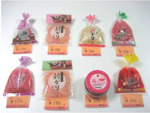
Figure (1): Photograph of Product Samples

Above, from left : Samples 1-3 Below, from left : Samples 4-6