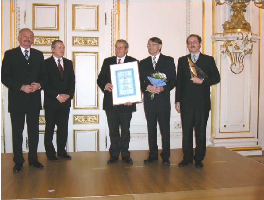
Fig.2. The representatives of VSB–TUO are awarded by Czech Republic National Quality Award 2007 at Spanish hall of Prague Castle.