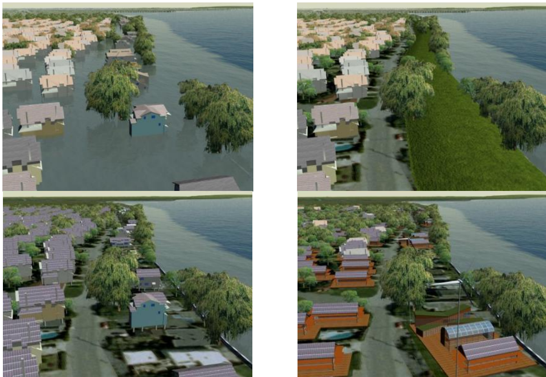
Figure 2 a-d. (from top left to right, to bottom left to right) a. Scenario 1 illustrates more frequent flooding and abandonment of houses; b. Scenario 2 shows a berm as an adaptation strategy; c. Scenario 3 includes incremental retrofits of stilts and solar panels; d. Scenario 4 depicts a new urban design with low-carbon, energy and food producing clusters with integrated resilience to projected impacts.

Figure 2 illustrates the four scenarios in one well-known local neighbourhood, providing an understanding of what each of the four scenarios look like in one location. Figure 3 demonstrates the use of multiple spatial scales for contextualizing climate impacts while at the same time exploring detailed, localized adaptive and mitigative solutions.