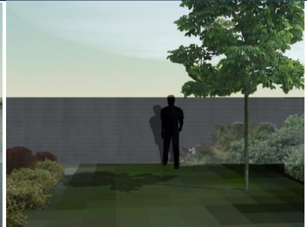
Figure 3 a-d (from top to bottom). Impacts and adaptations from Scenario 2 shown at a. Larger sub-regional scale with sprawling future sub-urban development into high-flood-risk agricultural areas; b. Neighbourhood scale demonstrating existing community risk to sea level rise; c. An “in-my-own-backyard” view of adaptive housing necessary due to the risk of a dike breach; d. A detailed depiction of sea-wall raising to the height sufficient for protecting homes under this climate scenario. (Credit: David Flanders, CALP/DCS, UBC).