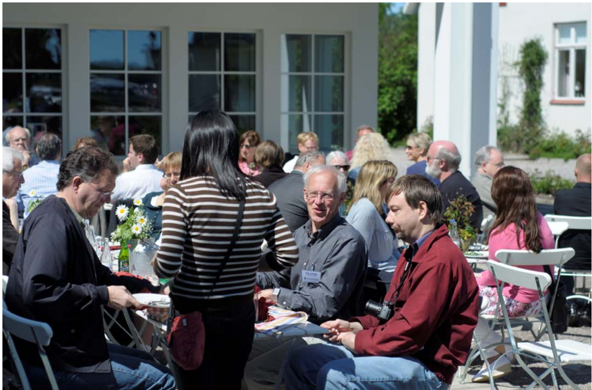
Workshop participants enjoying the lunch prepared by themselves at Båsenberga Hotel & Konferens in June 2009.

Since 2008, HEAD Graduate School organises a summer workshop held each year. The workshop gives Ph.D. students experience of what it is like to organise a scientific conference and it provides them with an opportunity to present and discuss their research with other researchers within the field of hearing and deafness. Of course, the workshop is also about having a good time together. Thus, the program also includes social activities where participants can interact in a more laidback fashion. In 2009, when the workshop was held at Båsenberga Hotel & Konferens, one of the activities was to prepare lunch together outdoors. This year, however, participants will not be asked to cook. Instead, rumour has it that social activities might have something to do with dolphins.