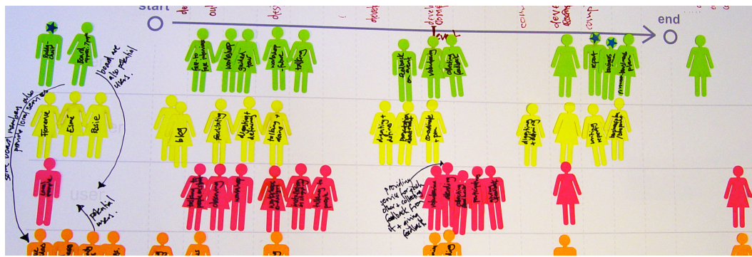
Figure 2, Examples of visual narrative produced by participants