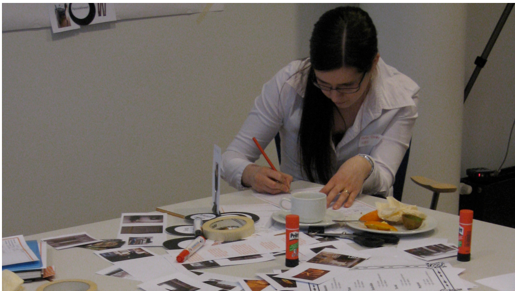
Filling out the character template during a game session.

The weekly schedule that presents possible situations that may take place in the senior houses. Aim of this document was to drive the happenings in the game. It also tells about the service level of the senior house the characters live in. Two different schedules were created with a large variety in service level.