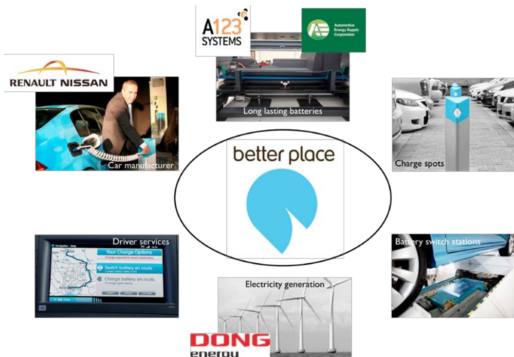
Figure 1 BetterPlace is an example of a complex networked innovation project

Let us show some of the challenges for this by means of the development of electric vehicles. Electric mobility is a needed solution for several social issues, such as pollution and costs. It is also technologically possible because of the increasing availability of alternative energy sources. BetterPlace is a global provider of electric vehicle networks and services. They provide services for enabling confident adoption and use of electric vehicles in which they build and operate the infrastructure and systems to optimize energy access and use. To enable a successful and therefore compelling service in the end, BetterPlace needs to provide an integrated solution to electric transportation. BetterPlace works together with governments, businesses and utility companies, like A123 Systems, Renault and the Automotive Energy Supply Corporation to accelerate the transition to sustainable transportation (see Figure 1).