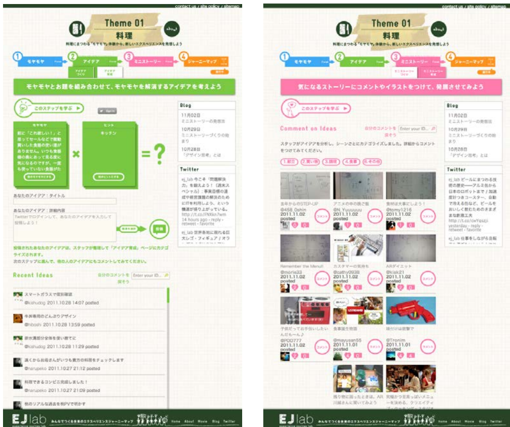
Figure 2 Experience Journey Lab.