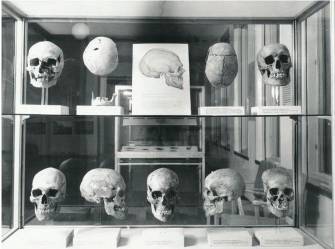
Figure 3: Racial theory as displayed in Ten Thousand Years in Sweden in the Younger Stone Age Hall in 1960. The contents of the display case are basically the same as the arrangement made by Carl Magnus Fürst in 1927 or 1928, which in turn derives from a 1920 book written by Fürst.

the museum moved to Narvavägen in 1939. At least it is mentioned in guide books as late as 1937 [...]. In the new Narvavägen exhibition, Ten Thousand Years in Sweden , a similarly arranged case was placed in a prominent position near the windows overlooking the yard in the Younger Stone Age Hall. (Fig. 3). (Svanberg in Print: 18f)