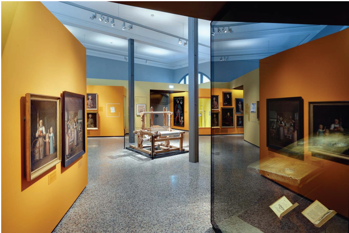
Figure 6: The room of proto – industrialization (© Donat Stuppan, Swiss National Museum).

diplomatic disagreements and foreign intervention. A media station displays extracts from foreign news media covering this period.