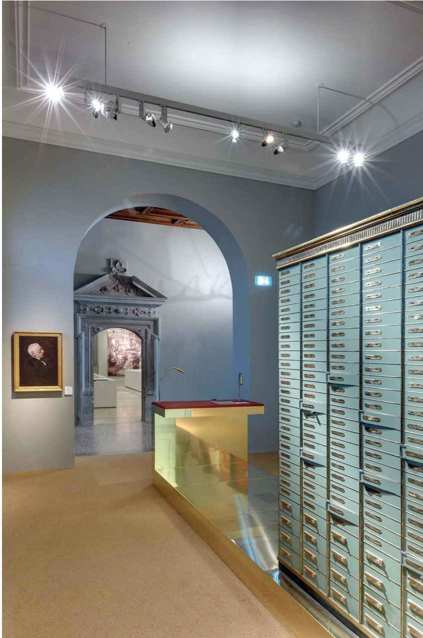
Figure 8: The room of the history of banking: the customer safe of 1912 (© Donat Stuppan, Swiss National Museum).