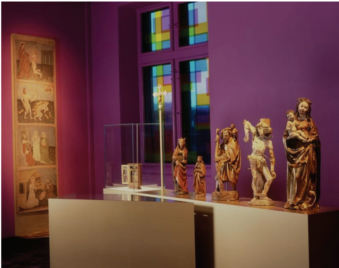
Figure 3: View to the first room of the second part of the exhibition: religious history.

These three points are clearly demonstrated in the two rooms devoted to the medieval world of religion and the Reformation. First a space evoking the medieval world of religion – then a break: A space designed in a deliberately sparse manner, mainly in grey, is evocative of the churches stripped of decoration and beheaded saints – the visitor is made to realize that he is in the Reformation room. Statements are accentuated by the scenography. In these two rooms the visitor, the “perceiving subject” (Janelli, Hammacher, 2008: 47), experiences an abrupt change (of style), a break that in reality one does not encounter in this form or to this extent).