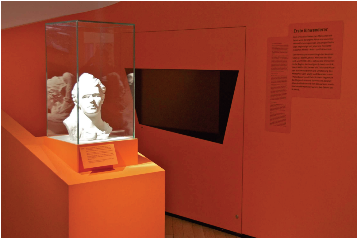
Figure 2: Homo alpinus helveticus – in the entrance of the exhibition.

Since Switzerland and the EU signed the Freedom of Movement Agreement in 2002 a new group of people has been immigrating into Switzerland: highly qualified Germans that are needed by various highly specialized sectors of the Swiss economy. At the end of this section of the exhibition the visitor's attention is drawn to this development.