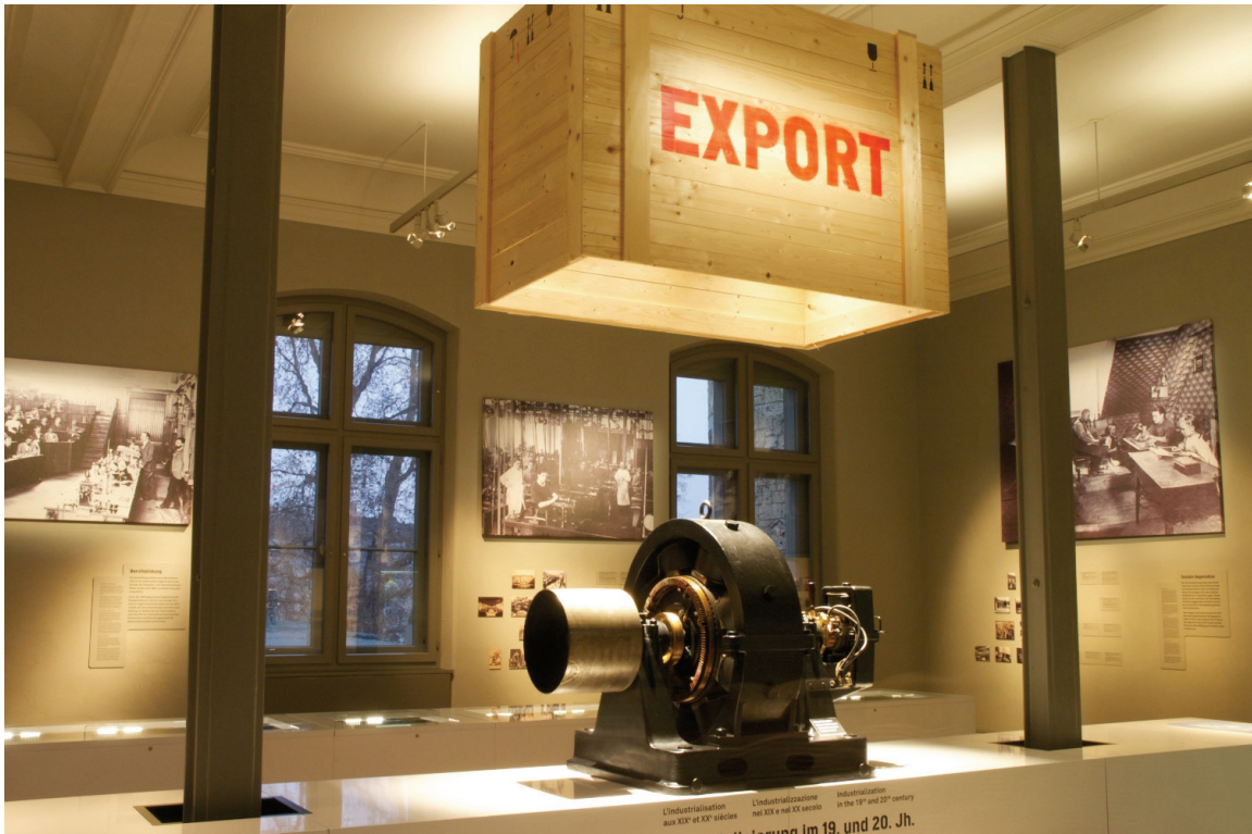
Figure 7: The room of industrialization: in the center of the room: the alternating current generator of 1895.

In the second room, which deals with the Age of Industrialization (Figure 7), three large banks of display cases feature not only textiles, but also important Swiss watches, milk products and chocolate. In the centre of the room stands a symbol of the machine industry, an alternating current generator made by a major Swiss company. The back row of display cases covers the history of the chemical industry, which started to take off at the beginning of the 20th century.