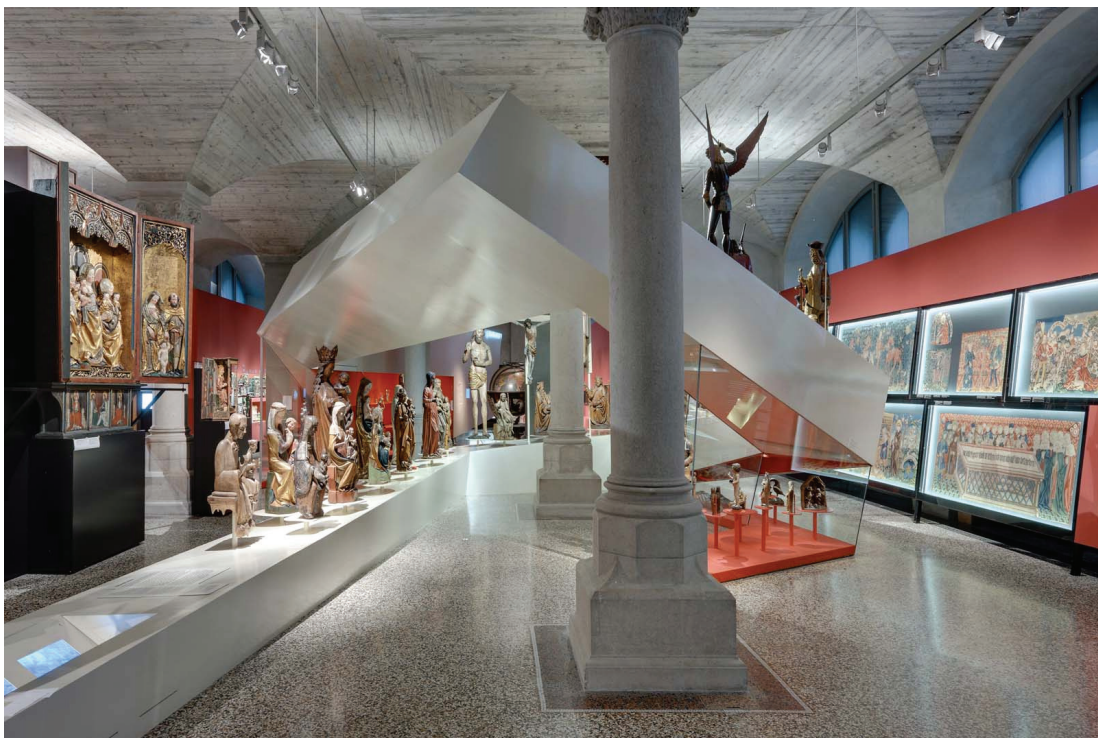
Figure 1: The other permanent exhibition: “Collections Gallery”.

As work began on the historical exhibition, it became clear that the National Museum's collections were evidence of an early understanding of Swiss cultural history and corresponding fields of research. The Swiss National Museum has collected outstanding arts and crafts objects. In addition to a significant archaeological collection, there has been a focus on collecting military history items (weapons and uniforms), gold and other precious metals, textiles, ceramic stoves, paintings, prints and historical photographs. The acquisitions policy followed that widely adopted by national museums of cultural history in the beginning and in later years. It was therefore self-evident that one of the new permanent exhibitions would be dedicated exclusively to the museum's early collection activities, and that a number of prized objects from the museum's various collections should be put on display. The first exhibition, “Collections Gallery”, therefore reflects the Swiss National Museum's collecting activities and shows a variety of exceptional items displayed in a purely object-oriented manner. (Figure 1).