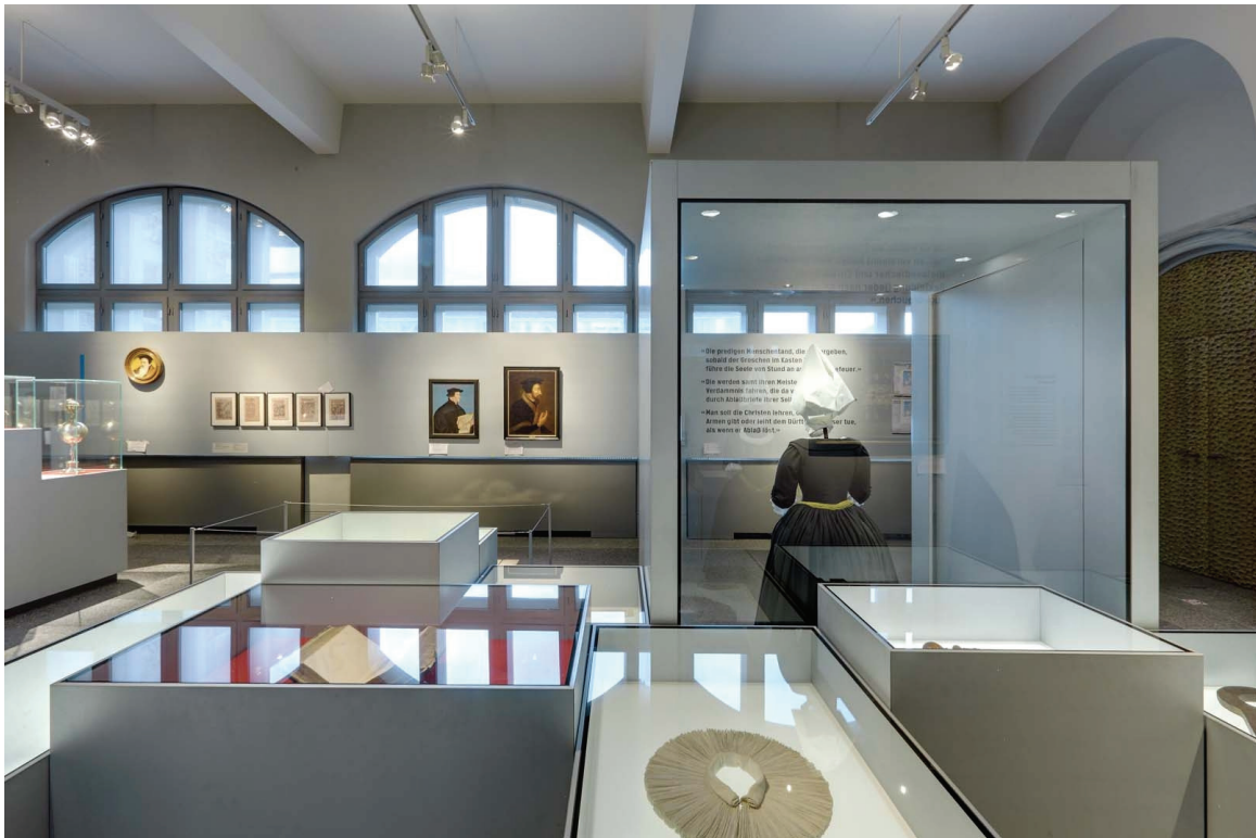
Figure 4: The Reformation room (© Donat Stuppan, Swiss National Museum).

The exhibition continues along a corridor, where the subject is the Counter-Reformation, the Catholic reform in the Catholic Church heralded by the Council of Trent, including for example the consolidation of the church authorities, adhering to celibacy, establishing seminaries (founding of a Jesuit College in Switzerland).