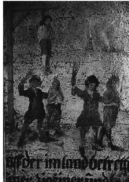
Warning signs for gypsies at the entry of the castle of Harburg bei Nördlingen 18 th century 39

It is not necessary to stress the topicality of these historical experiences in the light of today's ban on begging in Austria and other European countries. I sum up these historical examples so extensively to demonstrate, that expulsion, which means forced migration if you want to call it this way, is not a local phenomenon, not a national phenomenon, not a new phenomenon. These countries from which Roma are deported today look back on a century- long experience. Expulsions can euphemistically be called push-factors of migration, the victims of such push-factors are called refugees.