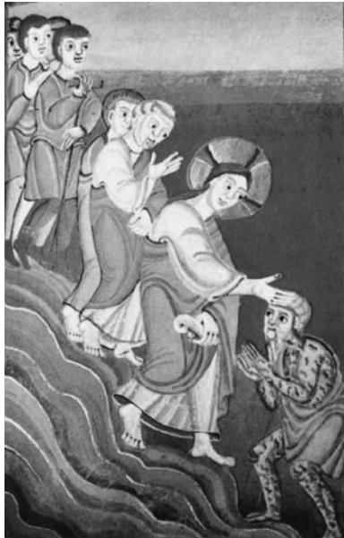
Illumination from Codex Echterbach (about 1040)

pericope of the healing of the leper (Mark 1,40-45 par) Jesus overcomes this gap by touching him and thus healing him. Touch, the most intimate form of contact, is a healing from exclusion.