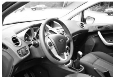
Figure 5: “Cheaper, practical materials”

Mass customization, i.e., catering to consumers’ needs, can be used as a way to achieve the cost-effective goal of purchasing. More specifically, the ability of consumers to choose which design elements should be implemented for targeted products without spending money for