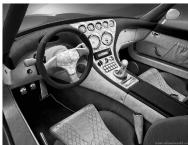
Figure 3: “Changeable interior style”

As shown in the category scores in Table 3, “changeable interior style” (See Figure 3) had a stronger effect on “design for enthusiasts of sport or recreation” than the others. In addition, “design for singles” had a stronger negative effect on this factor than the others did.