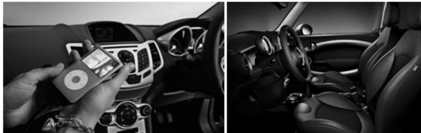
Figure 6: “Customized for the needs of the E Generation”

unnecessary features could be an invaluable marketing tool. In fact, the current study, showing the preference for “customization for consumers’ needs” indicates that the functionality and usability of crossover B-car interiors reflect not only consumers’ preferences but also their motive to save money. “Customized for consumers’ needs” can be further broken down into two aspects: the first aspect is “customization for the needs of a specific population”, meaning that interior equipment should be designed according to a specific populations’ needs. Thus, specific items include designs for the E Generation (Figure 6), females, housewives, passengers, singles, and designs for consumers that show a preference for sport or recreation vehicles. The second “customized for consumers’ needs aspect is “customization for individual preference”. Therefore, specific design aspects should include customization of interior style, interior equipment, the disposition of the central unit, and the selection of storage. In addition, optional decorative accessories and seating styles of should also be included.