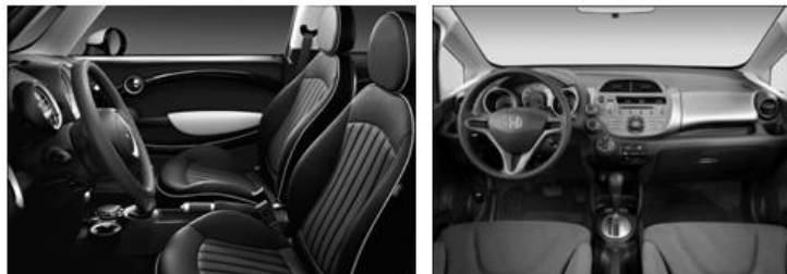
Figure 4: “Leather” and “integrated storage”