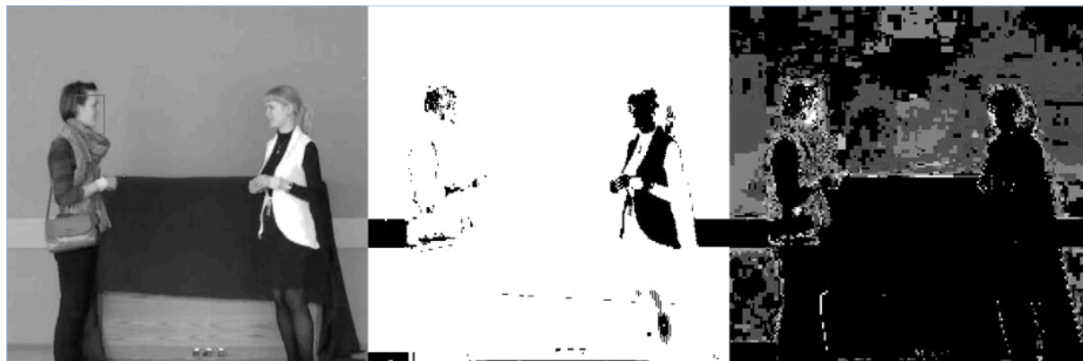
Figure 2. Normal video frame, saturation mask and probability map.

In order to select the most suitable area of an object for tracking, the user can enable the back projection display which shows the colour probability map of the current video frame. The colour probability map shows the most probable locations for the tracked object in the video frame, higher probability is represented by lighter pixel values. It is especially important to initially select as large an area of the object for tracking as possible but not include any parts of the background in the selection.