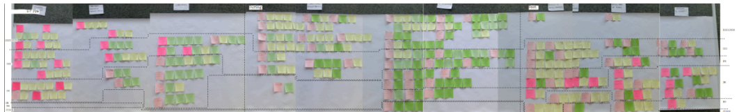
Figure 1: Screen shot of compiled image showing multiple coding collections for the 'how' evaluation objective at Charity B (anonymised)

Each image (there were 12 in total) showed the multiple coding collections related to an evaluation objective across the case study timeline e.g. multiple coding collections for evaluation objective how in Charity B, as in Figure 1: