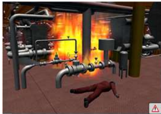
Figure 2: Emergency situation, Visualization of fire in COMOS Walkinside simulator (Siemens AG, 2013).