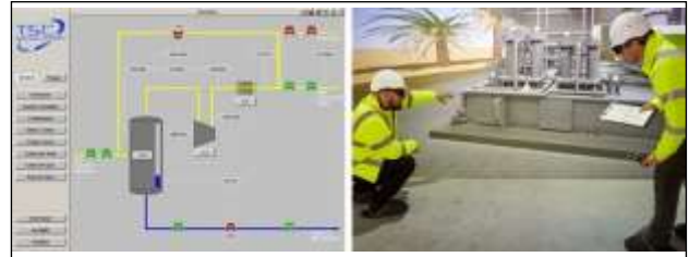
Figure 1: Process simulator by TSC Simulation is connected to the virtual reality environment I3TE by EON reality.

performance. Generally, the assessment of performance is made by an expert assessor, which can easily be biased by his/her experience and knowledge. Therefore, objective performance measures ensure more robust, consistent, and unbiased assessments of performance.