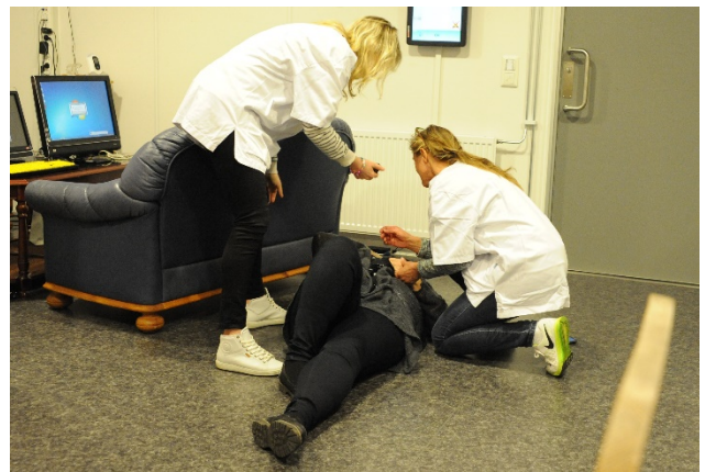
Figure 3. The home nursing service at the patient's home geographically closest to the patient. A home visit followed, see Figure 3.

During the simulation 2, the smartphone app and the information system for telecare alarm service had been further developed and had additional functionality. Three models for handling alarms were tested. In the scenario 1, the alarm from the patient's home was automatically notified directly to the municipal home nurse, to the nurse on duty that had patient registered on a task list or was