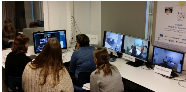
Figure 1. A group of four observers in the observation room

Three simulations of health care were run in April, September and November of 2016. In each simulation, there were different role-based scenarios, each with a description of a context and a concrete situation to be handled. The roles were: a) patient at home triggering a