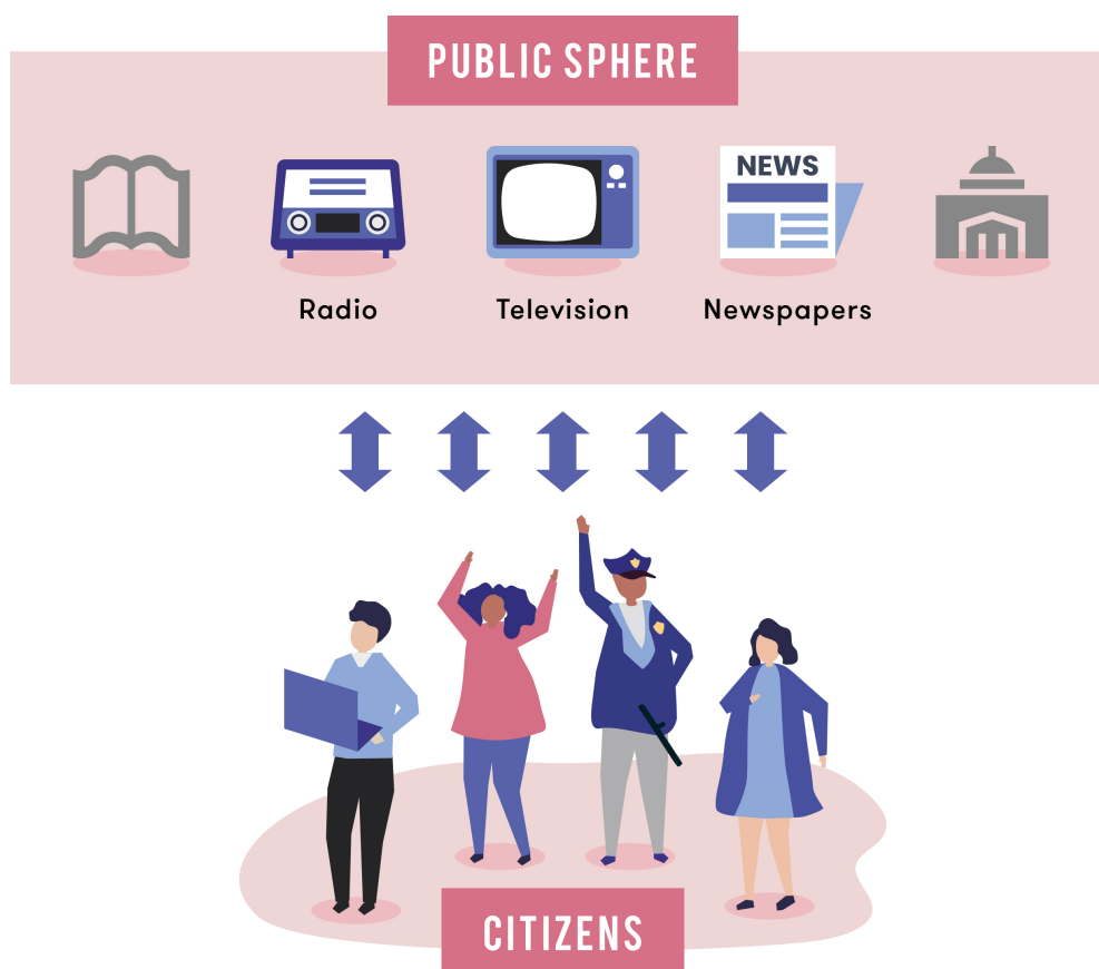
Figure 1. The digitized datasets in the context of the public sphere 5

Although media studies is a heterogeneous field of study (Bron et al. 2016, 1536), many strands within it depart from theoretical conceptualization in order to understand the complex role of media and their relation to both media producers and media consumers. Our claim is that drawing on conceptual insights from media studies is one way to critically bridge the gap between distant and close reading of digital media sources to reconstruct historical public debates. Bridging this gap, or fully grasping what goes on between the different distant reading methods and close reading of the material, is essential in order to make the research environment solid for historical research on public debates.